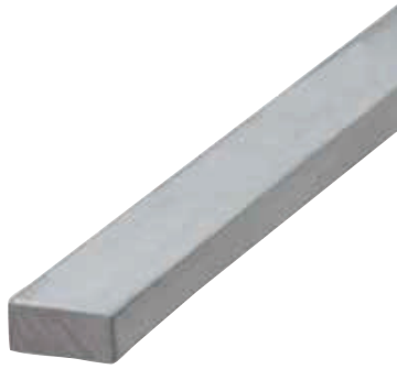
Bracing profile BP AL